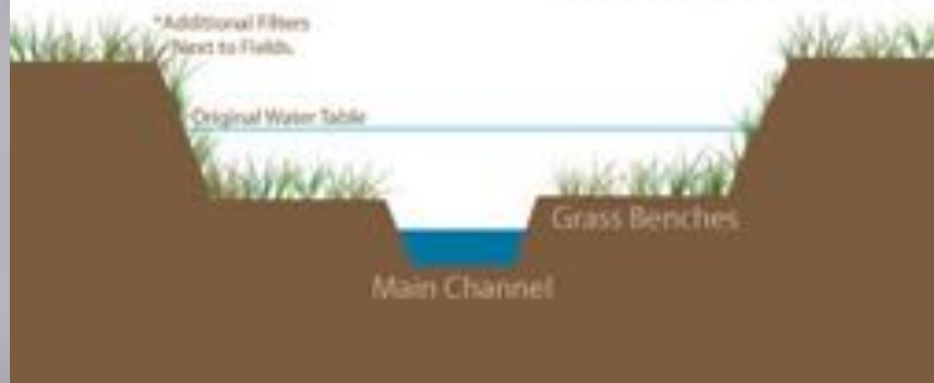
Two-stage Ditch Design